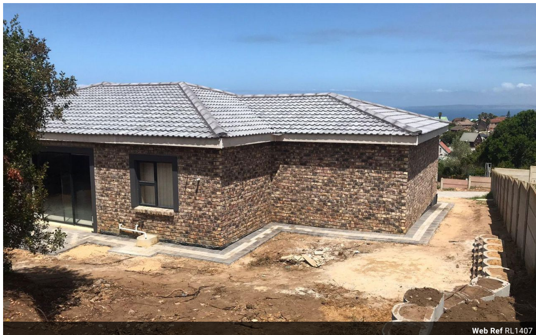
Web Ref RL1407

Regus Office Willowbridge Centre Carl Cronje Drive Bellville 7530