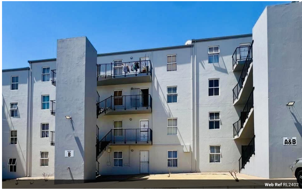
Web Ref RL2402

Regus Office Willowbridge Centre Carl Cronje Drive Bellville 7530