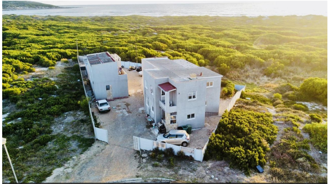
Web Ref RL2434

Regus Office Willowbridge Centre Carl Cronje Drive Bellville 7530