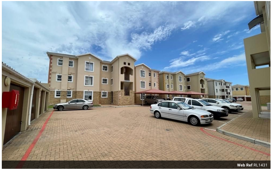
Web Ref RL1431

Regus Office Willowbridge Centre Carl Cronje Drive Bellville 7530