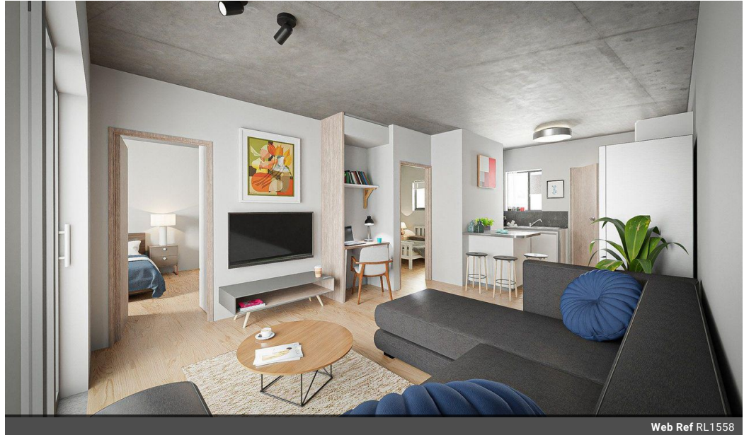
Web Ref RL1558

Regus Office Willowbridge Centre Carl Cronje Drive Bellville 7530