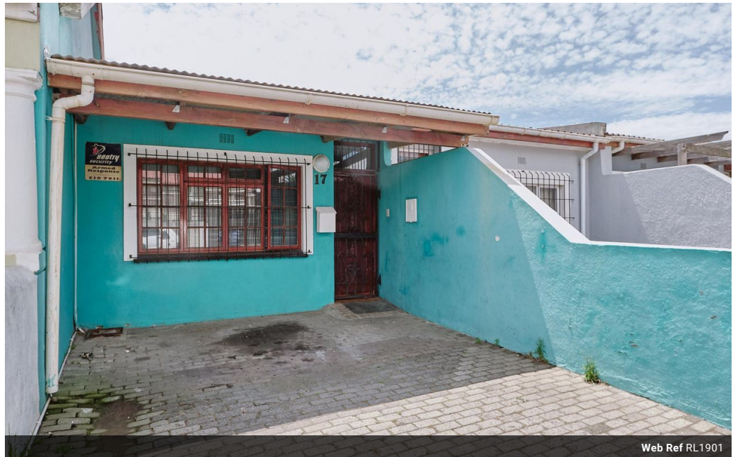
Web Ref RL1901

Regus Office Willowbridge Centre Carl Cronje Drive Bellville 7530