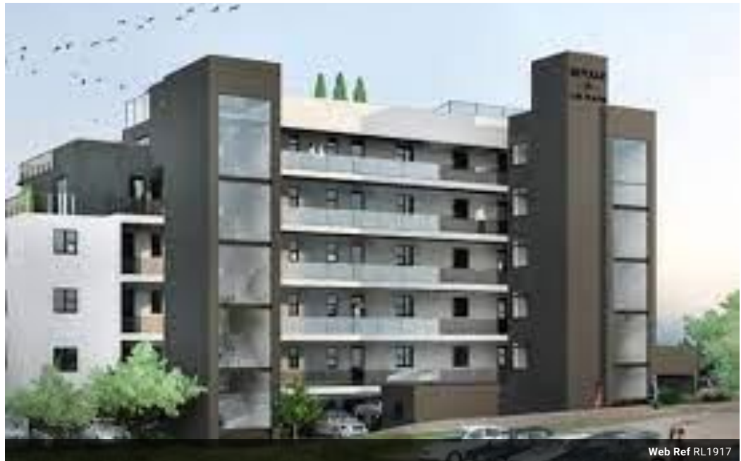
Web Ref RL1917

Regus Office Willowbridge Centre Carl Cronje Drive Bellville 7530