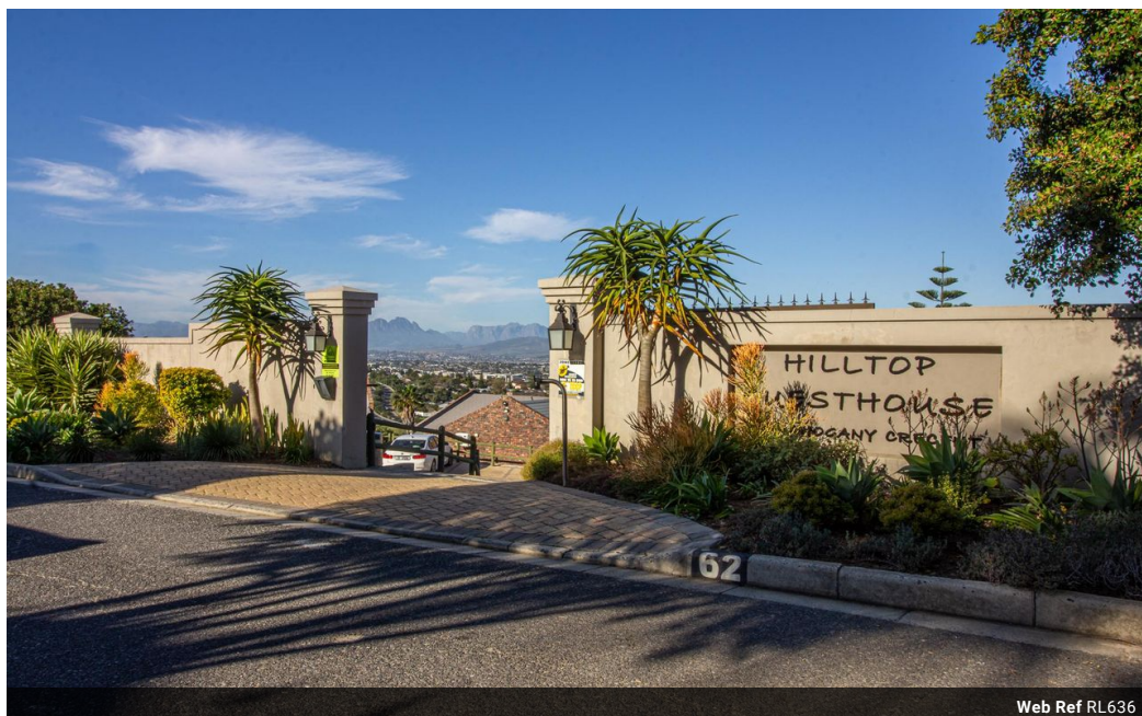
Web Ref RL636

Regus Office Willowbridge Centre Carl Cronje Drive Bellville 7530